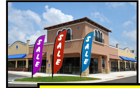
Advertising Blades (Wind Activated Signage)