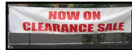
Banners (Temporary Signage)