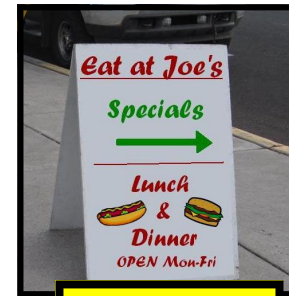
Sandwich Boards (Daily Signage)