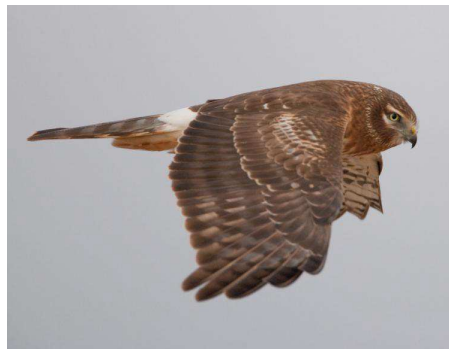
Female Northern Harrier