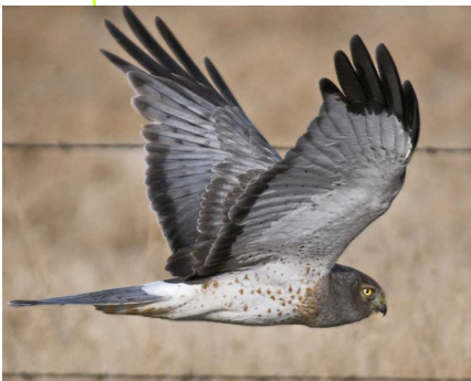
Male Northern Harrier