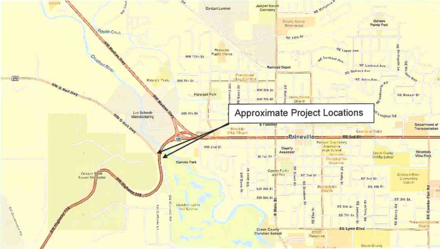
EXHIBIT A Approximate Project Location